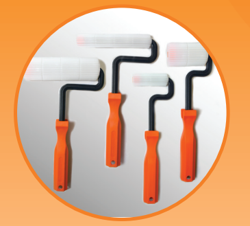
Smart and lightweight The series includes two different rollers that can easily be adapted for any job. They weigh 40% less than normal rollers.