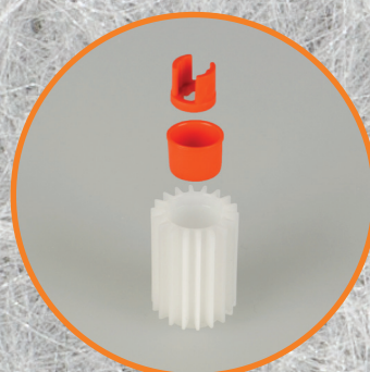
Loose acetal roll 26 x 35 mm with end lock