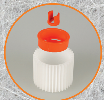
Loose acetal roll 44 x 35 mm with end lock