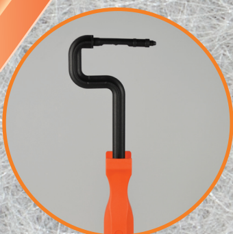
Handle and bend 70 mm

Handles with bends and keys as well as acetal rolls with end locks can be purchased separately. The ErgoRoller2 weighs 40% less than traditional rollers, has an ergonomic, easy-to-grip handle and produces a very homogeneous end result.