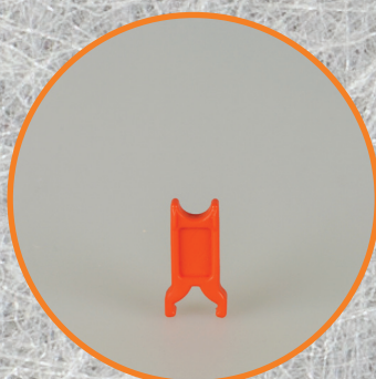
Key for end lock